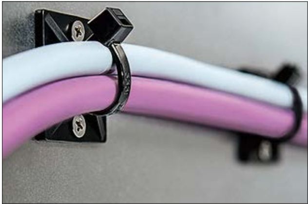
MB-Series Mounts with square design.